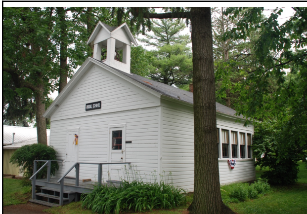
Millerburg School at Present