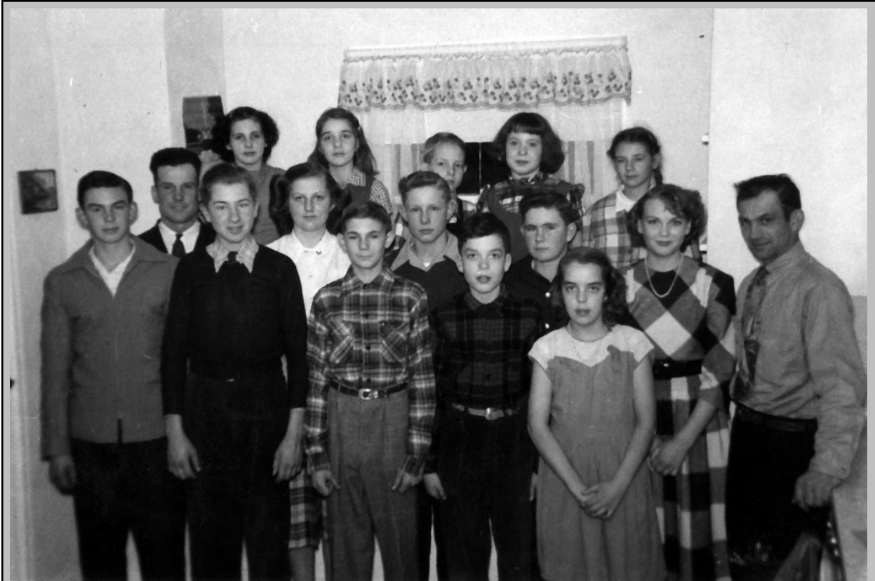
Harlem Helpers 4-H Club