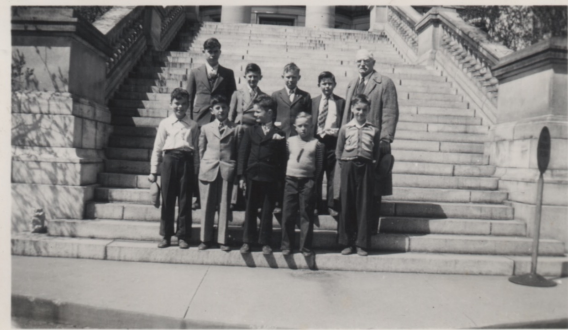
Madison Capitol Steps