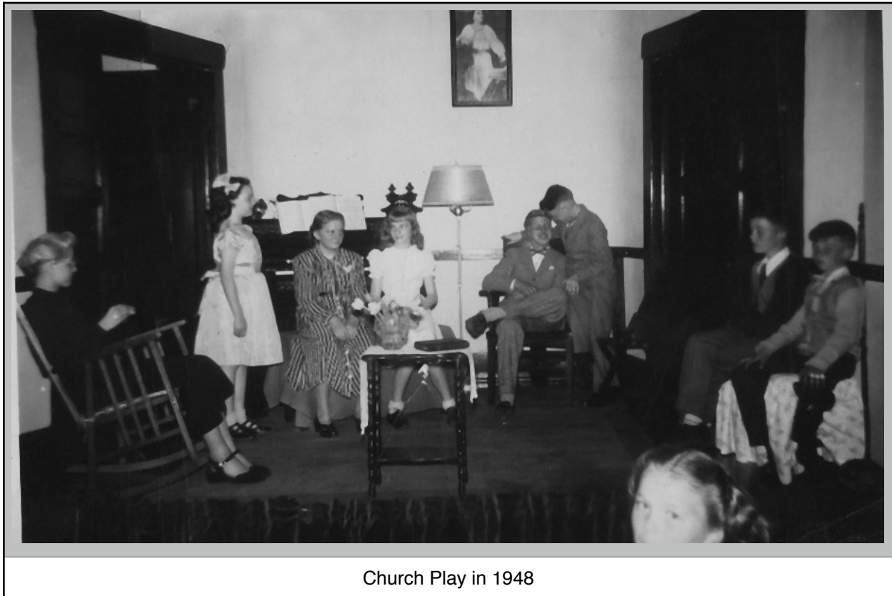
Church Play in 1948

Fouts and my parents had serious differences as to their philosophy and the practices of the church. These differences led to a split in the congregation with about half of them