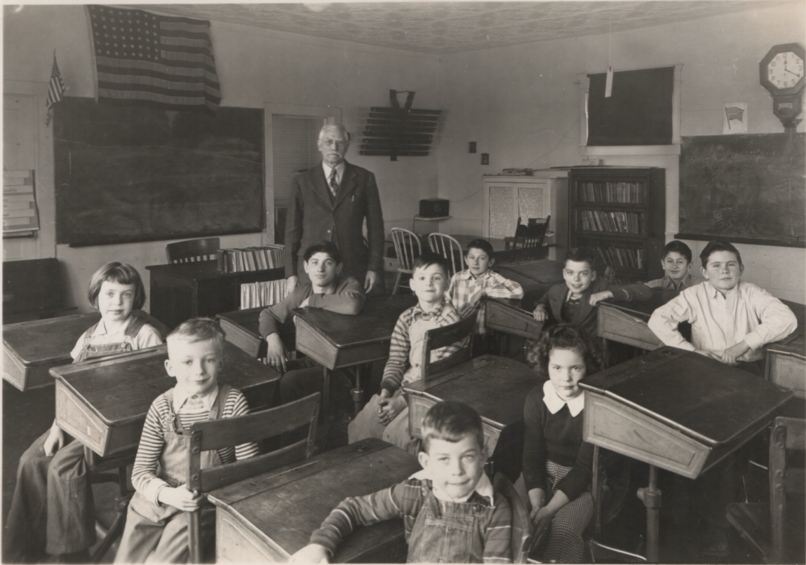
My Fourth Grade School Photo